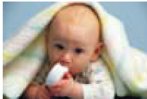
Low-res (Taken from internet 72 dpi)