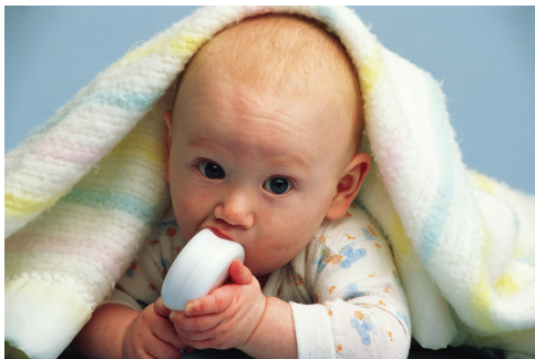
High-res (Scanned in at 300 dpi)